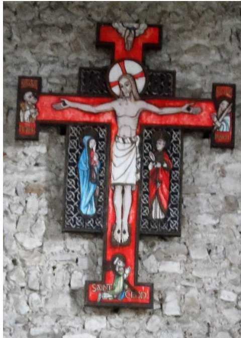
The crucifix in St. Peter's Chapel